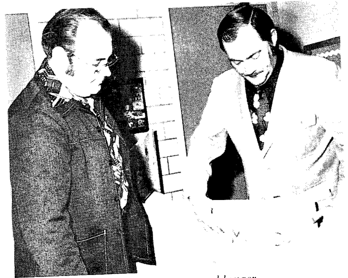
"SAFETY TOWN gives us greater and longer exposure than a 'one time ad' in a program. The houses are exposed for several months and seen daily by our customers."

In return, for their support and "involvement", fantastic publicity is received and enjoyed.