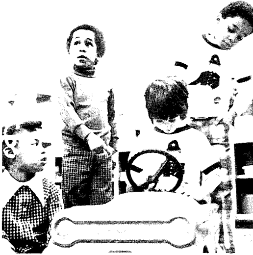
SAFETY TOWN was fun! I met lots of friends and learned lots of safety rules.